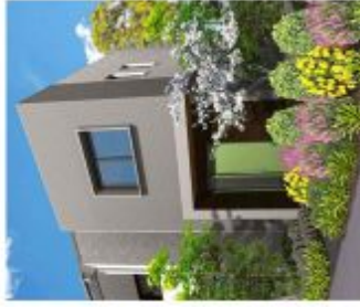
Artistic Impression - Indicative only